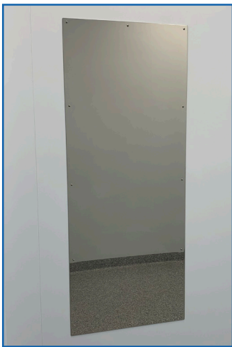
Stainless Steel polished flush mount mirrors