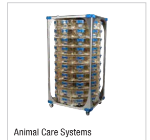
Animal Care Systems