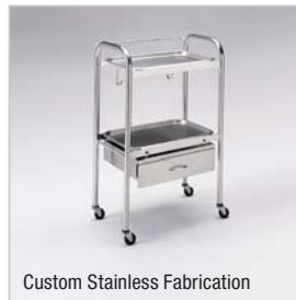
Custom Stainless Fabrication