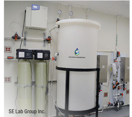
SE Lab Group Inc.