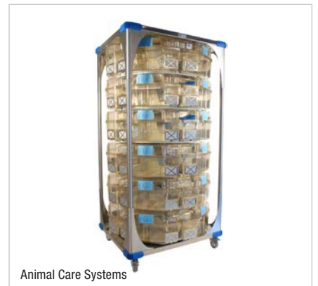
Animal Care Systems