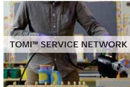
TOMI ™ SERVICE NETWORK