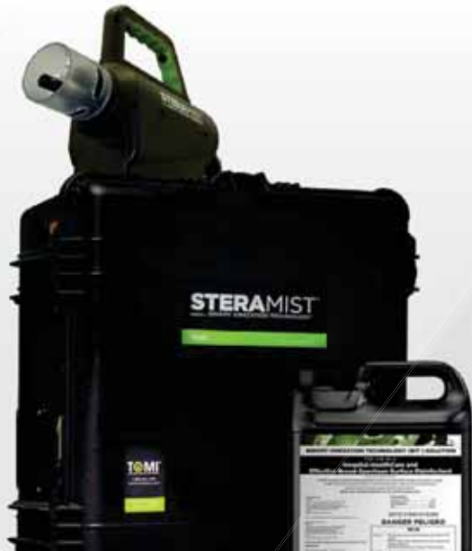
STERAMIST® SURFACE UNIT

Single-unit rental of the SteraMist® Surface Unit. Features a single applicator for versatile, portable handheld disinfection/decontamination. Available to current end users only. Daily and weekly rates available. BIT™ solution sold separately. Please call for availability.