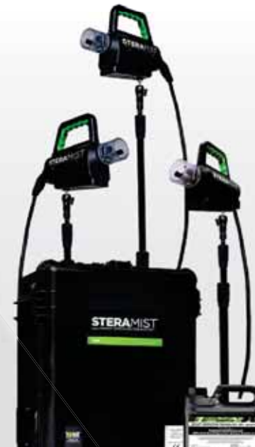
STERAMIST® ENVIRONMENT SYSTEM

Single-unit rental of the SteraMist® Surface Unit. Features a single applicator for versatile, portable handheld disinfection/decontamination. Available to current end users only. Daily and weekly rates available. BIT™ solution sold separately. Please call for availability.